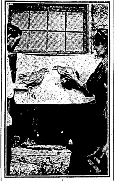
TO THE LEFT, GOOD TYPE OF CHICKEN FOR FATTENING FOR A BROILER; TO THE RIGHT, A POOR TYPE.

Broilers are young chickens weighing from three-quarters of a pound to two pounds apiece, the latter weight being the most common. The production of broilers as a special business has been tried without success on many poultry farms in the northeastern part of this country.