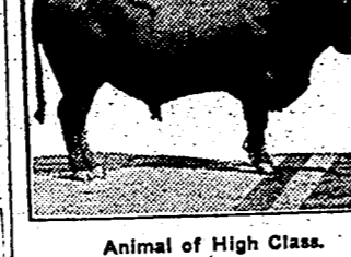
Animal of High Class.

Thought Machine Should Be Kept Well Oiled and in Good Condition for Duty It Must Perform.