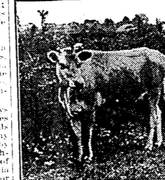
Fine Type for Dairy.